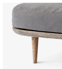
→ Smoked Oiled Oak w. Hot Madison 093