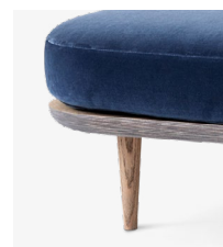
→ Smoked Oiled Oak w. Velvet 10 Twilight