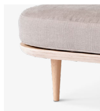
→ White Oiled Oak w. Hot Madison 094