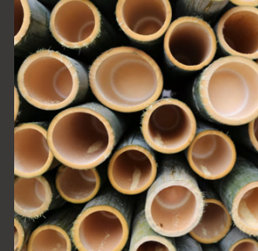
SIZED BAMBOO POLES