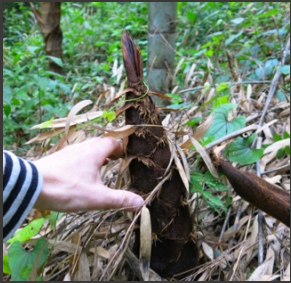
NEW BAMBOO SHOOT