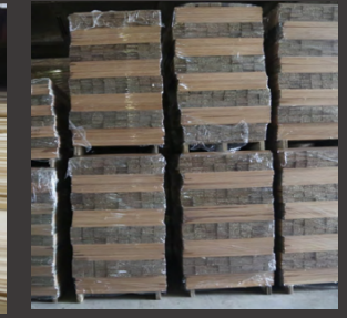
RAW MATERIAL STOCK